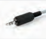
SL-K data cable for the connection of KaVo K-Control grinding systems