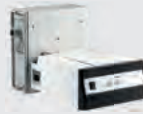
Z1-AT Suction unit with filter cassette