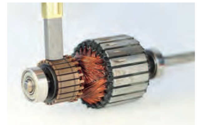
Motor after 1,000 hours controlled by trendsetting Zubler electronics.