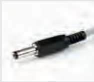
SL-Qube data cable for the connection of Schick Qube grinding systems