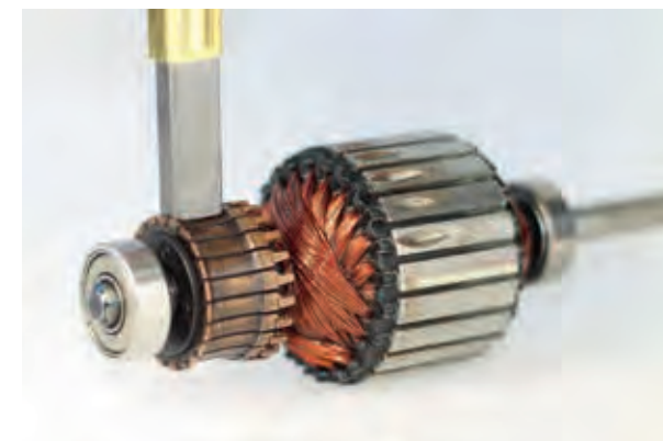
Motor after 1,000 hours with conventional control; the collector is heavily worn.

The effective running time of the motor can be read out and documented by means of a Bluetooth connection and the Zubler suction technology app . In addition, a timer provides the possibility to check histories of the usage durations of the individual motors.